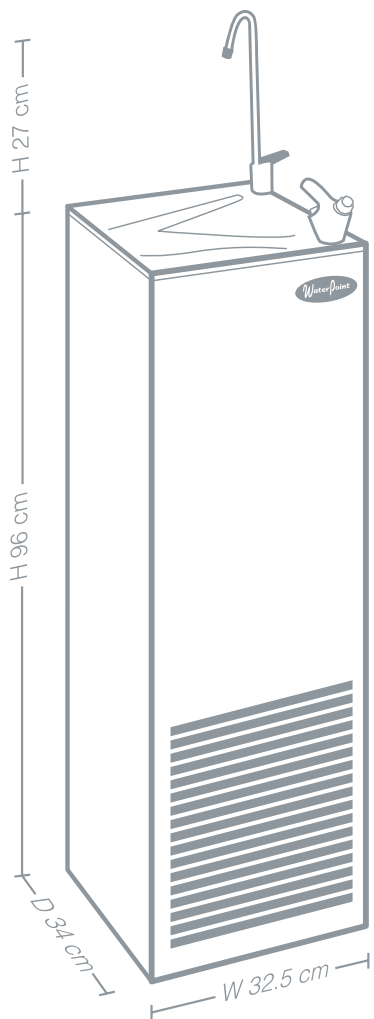
Weight Freestanding - 29Kg

To ensure that the Water Fountain can be installed quickly and smoothly in your proposed location, each machine will require a 13 am (240 AC) switched socket, which should not be more than one metre from the machine. Each fountain needs to be supplied with water from a rising main. Access to waste drainage is required.